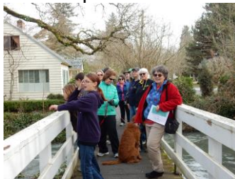
Thursday walkers at State Capitol

Court St bridge near 18 th St on NE Salem walk; it's to be replaced Summer 2017